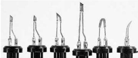
M MR KR PS S